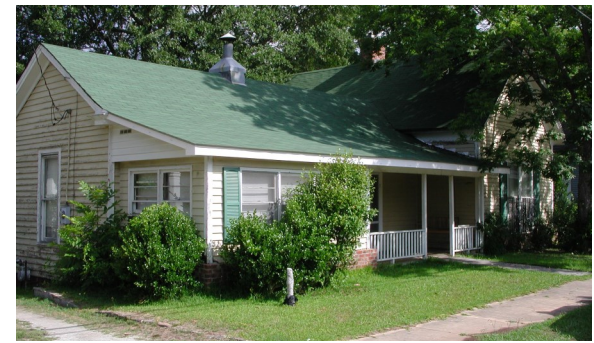
8 180 South McIntosh Street Victorian-style design, built in 1882.