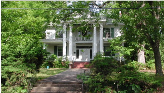
11 198 South McIntosh Street This Greek Revival home was built in 1861.