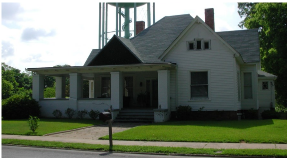
10 189 South McIntosh Street This home was built in 1890. It is a cottage layout featuring characteristics of several styles, including Greek Revival and Queen Anne.