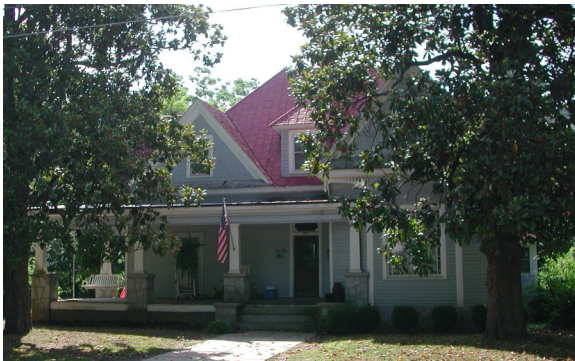
12 205 South McIntosh Street This home shows features of the Queen Anne Cottage style/ It was built in 1875.