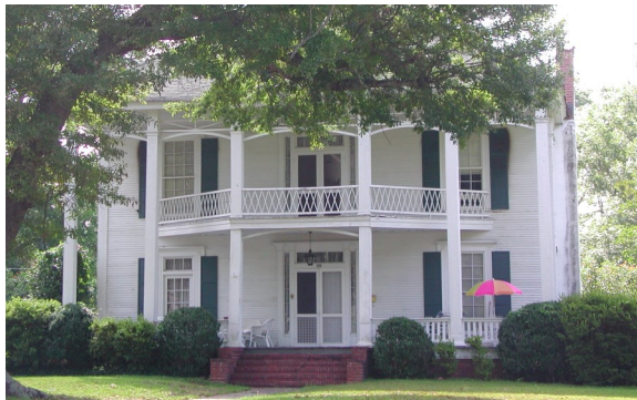
15 227 South McIntosh Street Greek Revival architecture, built in 1858.