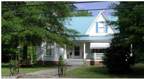
13 206 South McIntosh Street Queen Anne Cottage architecture, built in 1900.