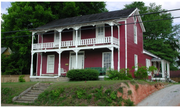
1 110 South McIntosh Street Built in 1860, this home, transformed over the years into a Victorian-style design, is one of Elberton's oldest.