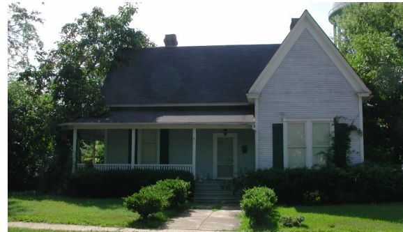
7 175 South McIntosh Street Built in 1867, this home is a cottage layout featuring Victorian characteristics.