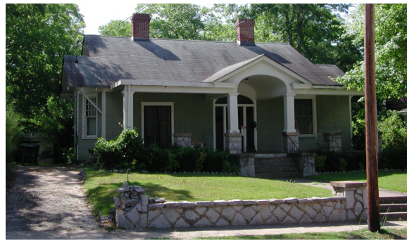
4 155 McIntosh Street This box cottage was built in 1918