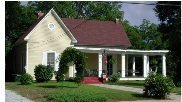
9 186 South McIntosh Street This is a Victorian cottage, built in the late-19th Century.