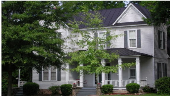
14 214 South McIntosh Street This home, built in 1882, displays features of Victorian architecture.