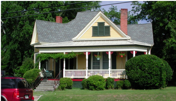
2 118 South McIntosh Street Queen Anne Cottage style, built in 1895.