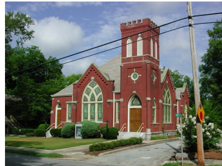
5 First Presbyterian Church A chapel featuring Medieval/Gothic architecture, built in 1909.