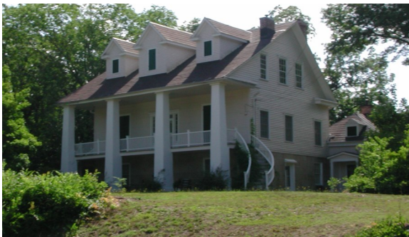
3 143 South McIntosh Street The Swift-Oliver Home, a Greek Revival structure built in 1855.