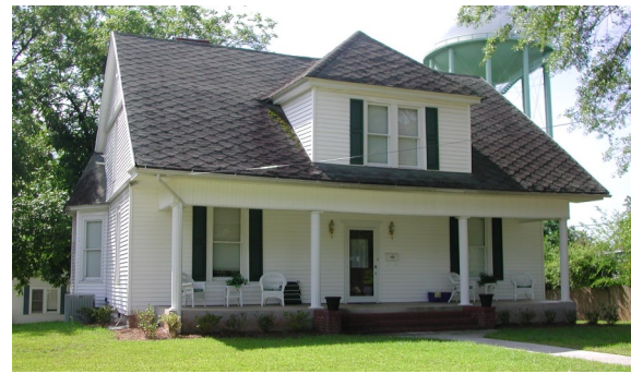
6 169 South McIntosh Street One of Elberton's oldest homes, built in 1862.